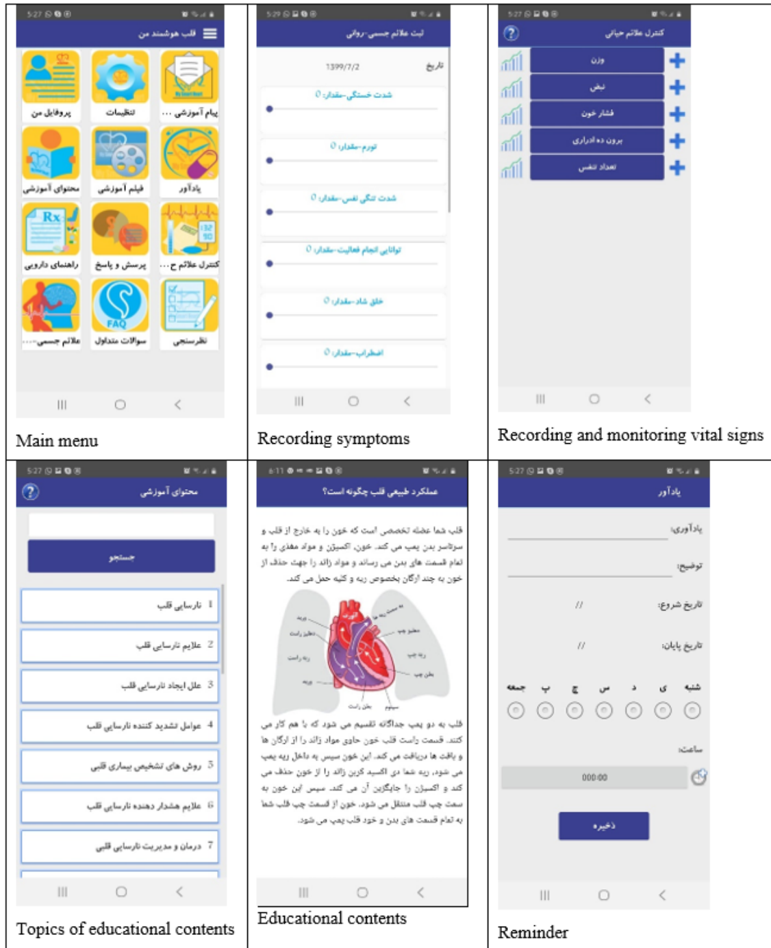
Figure 2. Features of the interactive Android-based smartphone app.

intervening, as needed; (4) displaying: displaying data regarding symptoms, vital signs, and weights graphically and textually, as well as the ability to extract the PDF and XML formats; (5) guiding: provision of guidance based on the data given by the user and provision of appropriate advice through communication with the researcher; (6) reminder or alert: reminding the user regarding the time of taking medicines, performing tests, and other requirements; and (7) interaction: bilateral interaction between the researcher and patient [25]. This app was provided to patients to use for 3 months.